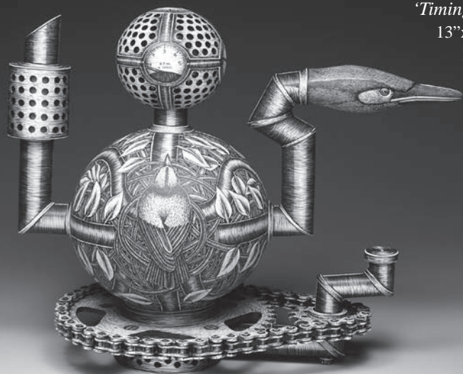
'Timing Chain' 13"x16"x10" Porcelain