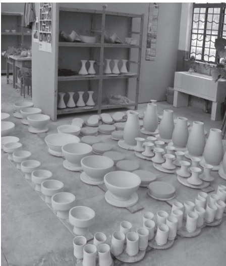
A day's work, greenware drying: WVU's studio facility at Jingdezhen Ceramics Institute